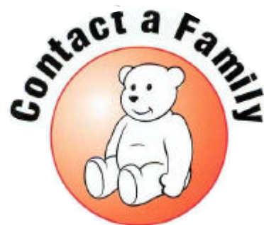
The logo of Contact a Family